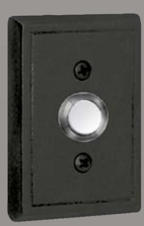
876 Doorbell Plate: 2-1/2" x 3-1/2"