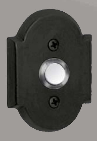
856N Doorbell Plate: 2-1/2" x 3-1/2"