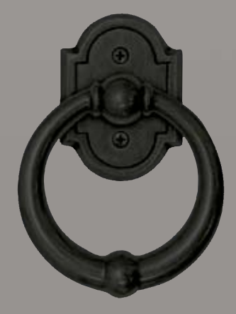
LK51 Knocker Plate Size: 2-1/2" x 3-1/2" Knocker Diameter: 5"