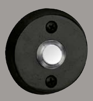
875 Doorbell Diameter: 2-1/2"