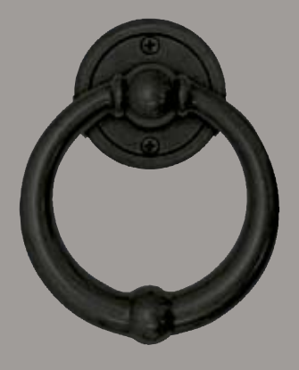
LK10 Knocker Rosette Diameter: 2-3/4" Knocker Diameter: 5"