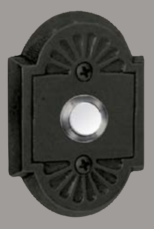
836 Doorbell Plate: 2-1/2" x 3-1/2"