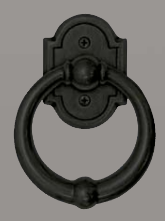
SK51 Knocker Plate Size: 2-1/2" x 3-1/2" Knocker Diameter: 4-1/4"