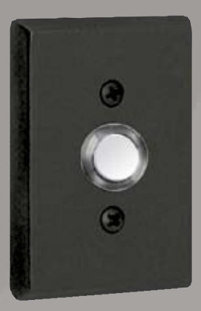
876N Doorbell Plate: 2-1/2" x 3-1/2"

Item Description H T 836 Doorbell 856, 856N Doorbell 875 Doorbell 876, 876N Doorbell