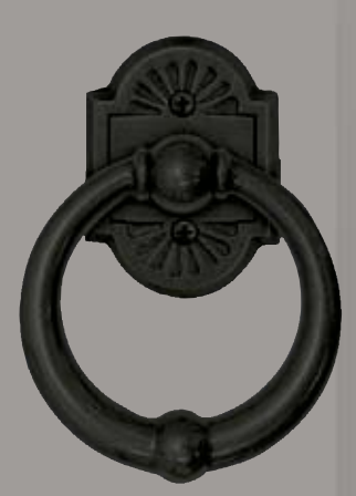
LK31 Knocker Plate Size: 2-1/2" x 3-1/2" Knocker Diameter: 5"