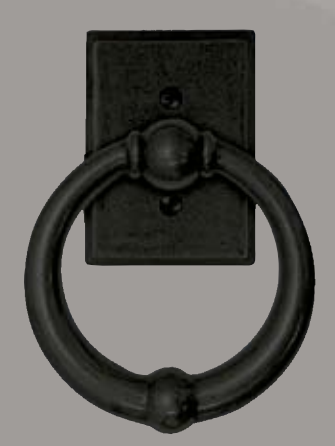
LK61N Knocker Plate Size: 2-1/2" x 3-1/2" Knocker Diameter: 5"