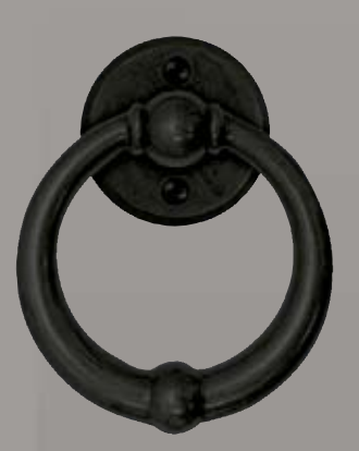
LK81 Knocker Rosette Diameter: 2-1/2" Knocker Diameter: 5"