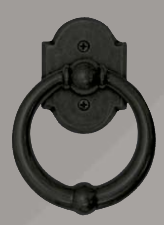
SK51N Knocker Plate Size: 2-1/2" x 3-1/2" Knocker Diameter: 4-1/4"