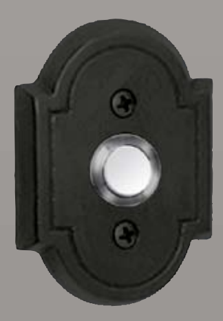
856 Doorbell Plate: 2-1/2" x 3-1/2"