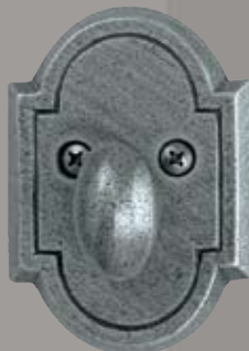
#825: Backplate measures 2-1/2" x 3-1/2"