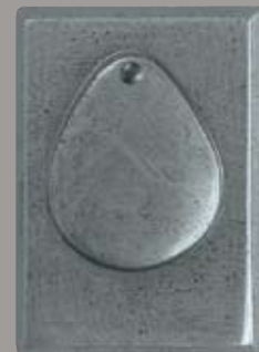
#851NC: Backplate measures 2-1/2" x 3-1/2"