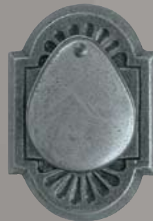
#853C: Backplate measures 2-1/2" x 3-1/2"