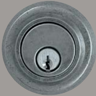
#800: Rosette measures 2-3/4" diameter