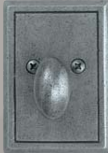
#801C: Backplate measures 2-1/2" x 3-1/2"