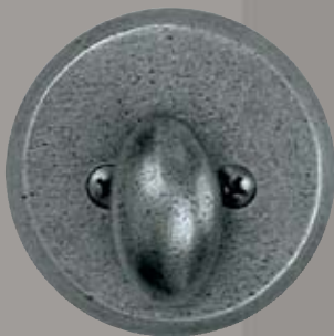
#820: Rosette measures 2-3/4" diameter