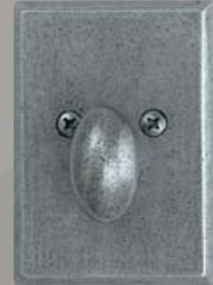
#801NC: Backplate measures 2-1/2" x 3-1/2"