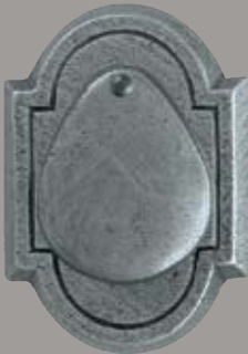
#855C: Backplate measures 2-1/2" x 3-1/2"