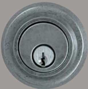
#850: Rosette measures 2-3/4" diameter