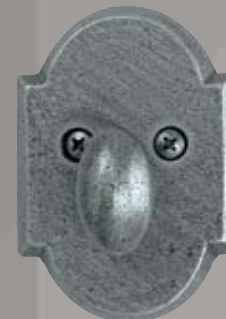
#825N: Backplate measures 2-1/2" x 3-1/2"