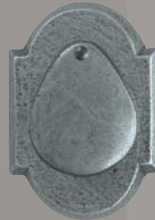
#855NC: Backplate measures 2-1/2" x 3-1/2"