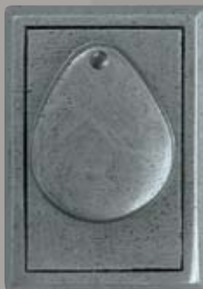
#851C: Backplate measures 2-1/2" x 3-1/2"