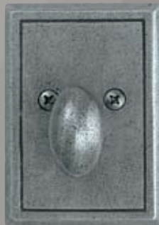
#821: Backplate measures 2-1/2" x 3-1/2"