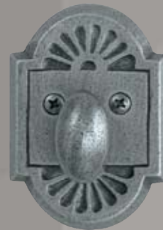
#823: Backplate measures 2-1/2" x 3-1/2"